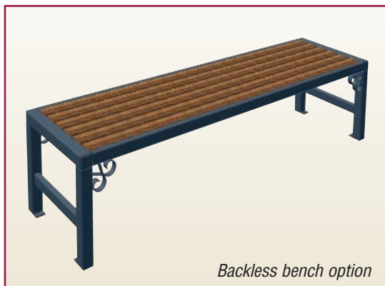
Backless bench option

Constructed of a 2" square steel frame and IPE wood slats, the KDB25 Trafalgar bench offers a solidly constructed frame with rustic wood seating. After the frame is galvanized, it is finished with King Luminaire's durable "KingCoat" powder coat paint finish. The KDB25 comes standard with IPE wood seat slats but other materials are also offered. The bench can be customized with a plaque inset, ideal for in memoriam dedications or other designation. Available in either 4, 6 or 8 foot lengths, each is equipped with anchor bolt mounting tabs to deter theft or vandalism. The KDB25 is also offered in a backless bench model.